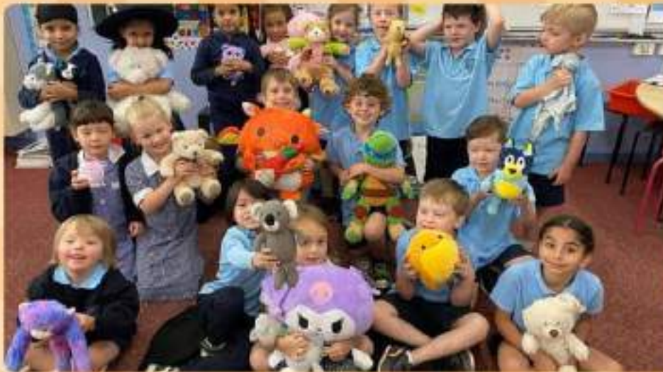
Prep J Teddy Bear Picnic